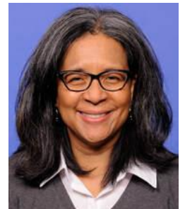
Congresswoman Marilyn Strickland