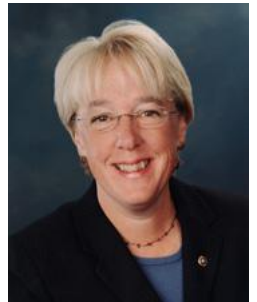
Senator Patty Murray